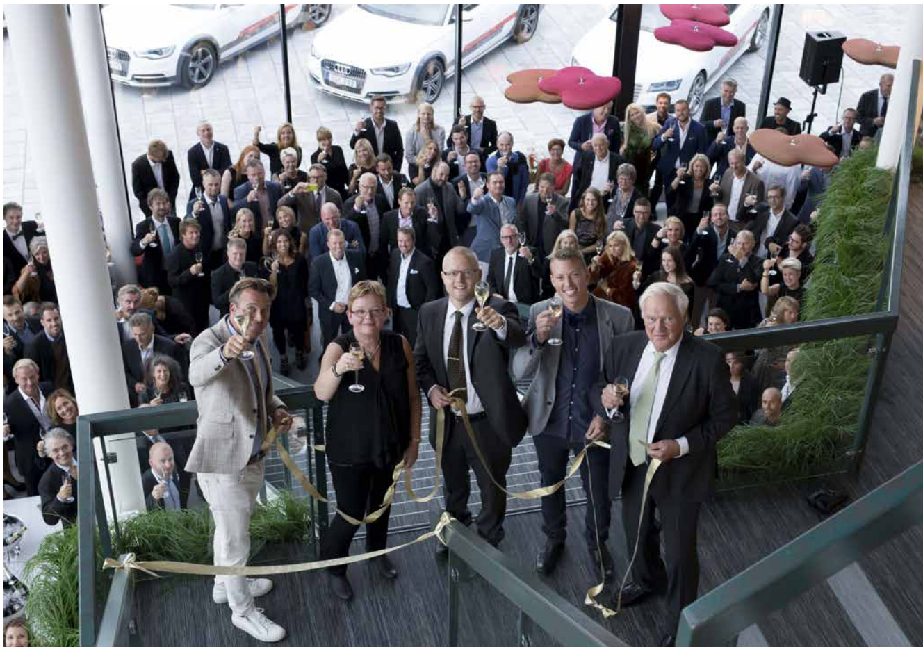
Inauguration Party was acclaimed as party of the year by most of the 170 clients and friends of Gotessons.

Playfulness is also something that sells. Computer Monitor protection in different colours with a zip around became a real bestseller for example.