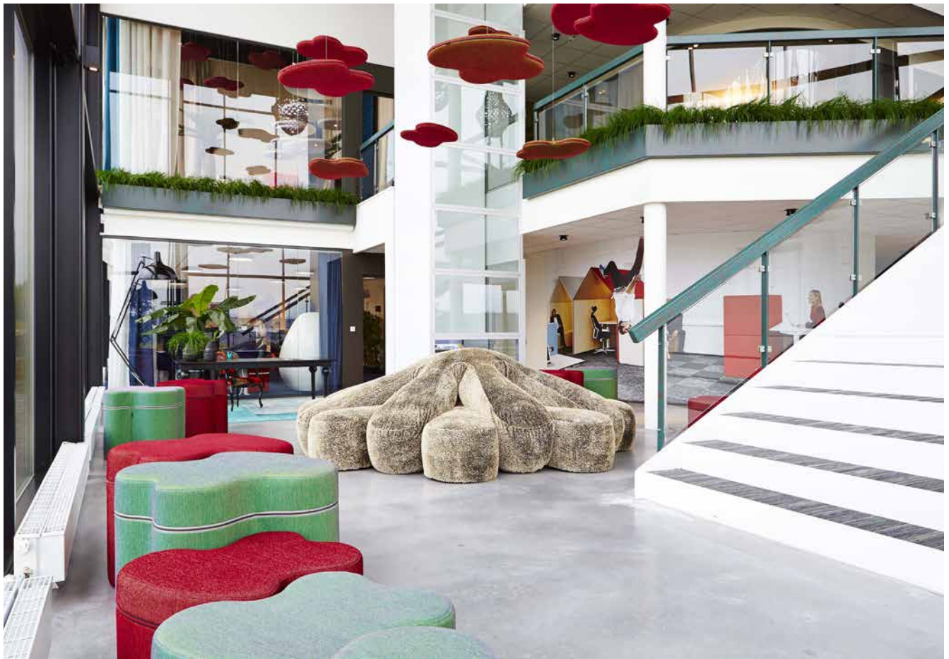
The entrance surrounded by glass and the ceiling is fourteen meters high. A custom-built white steel staircase with flashes of sponged-on green which leads up towards the upper two floors; and the outlandish starfish-like seating in the middle of the entrance hall.

development. 'Identifying customer needs and solving problems has always been Gotessons strength,' he says. 'Today screens which create privacy between work spaces in open offices and sound absorbers are bestsellers. We know that building owners, landlords and businesses are demanding ergonomic, functional and well designed environments.'