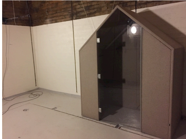
Figure 2: Half a Hut with door, against wall

A hut with outer dimensions (WxHxD) 1880 x 2270 x 900 mm. Made from panels with pine frame and PET-filling covered in fabric. Front panels are 60 mm thick, the rest of the panels are 40 mm thick. Half a Hut was measured with open front, with front panels and with front panels with an 8 mm plexiglas door. All versions were measured in the middle of the room and with backside facing a wall.