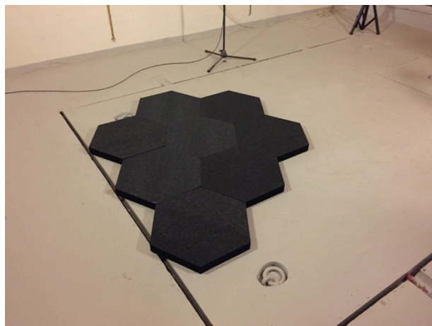
Figure 3: Honey 8 pieces

Hexagonal wall absorber with outer dimensions 520 x 600 mm, thickness 50 mm (area 0.234 m 2 ). Ecosund PET-filling dressed with Hush fabric. Honey was measured as a single object and in a group of 8 pieces (out. meas. 1950 x 1560 mm).