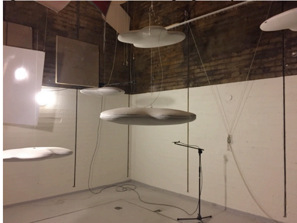
Figure 4: Hang Over

Absorber for mounting on wall, ceiling, or hanging freely. 3 mm MDF with sound absorbing filling covered in foam laminated fabric. Outer dimensions approximately 810 x 690 mm. Thickness 130 mm. Hang Over was measured hanging freely.