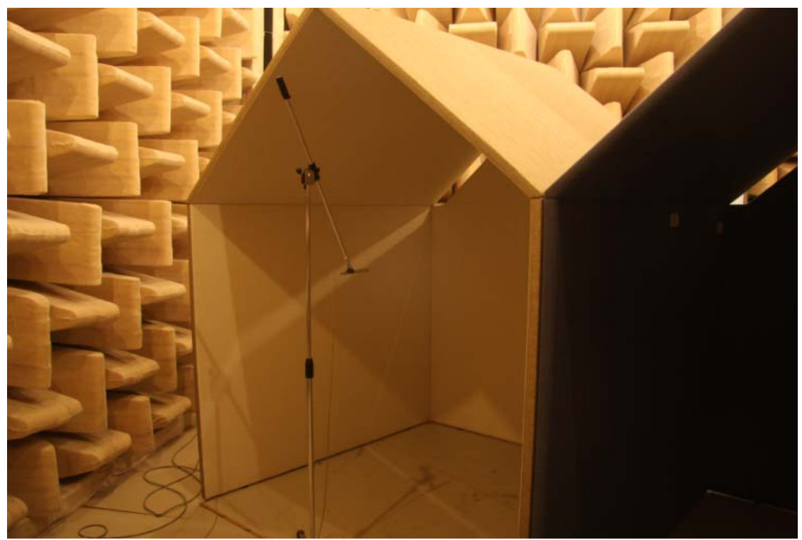
Picture 3 – Test arrangement for measurement of The Hut – inside the house. The standard microphone position is shown in the picture.