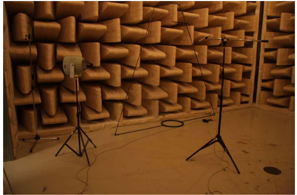
Picture 4 – Test arrangement for measurement of reference microphone position for The Hut – at joint.