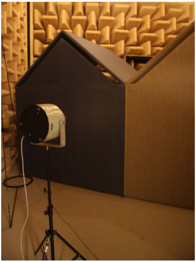
Picture 1 – Test arrangement for measurement of The Hut – at joint. The loudspeaker is shown in the picture.