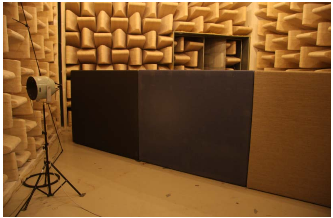
Picture 5 – Test arrangement for measurement of Sofa Sound Booth. The loudspeaker is shown in the picture.