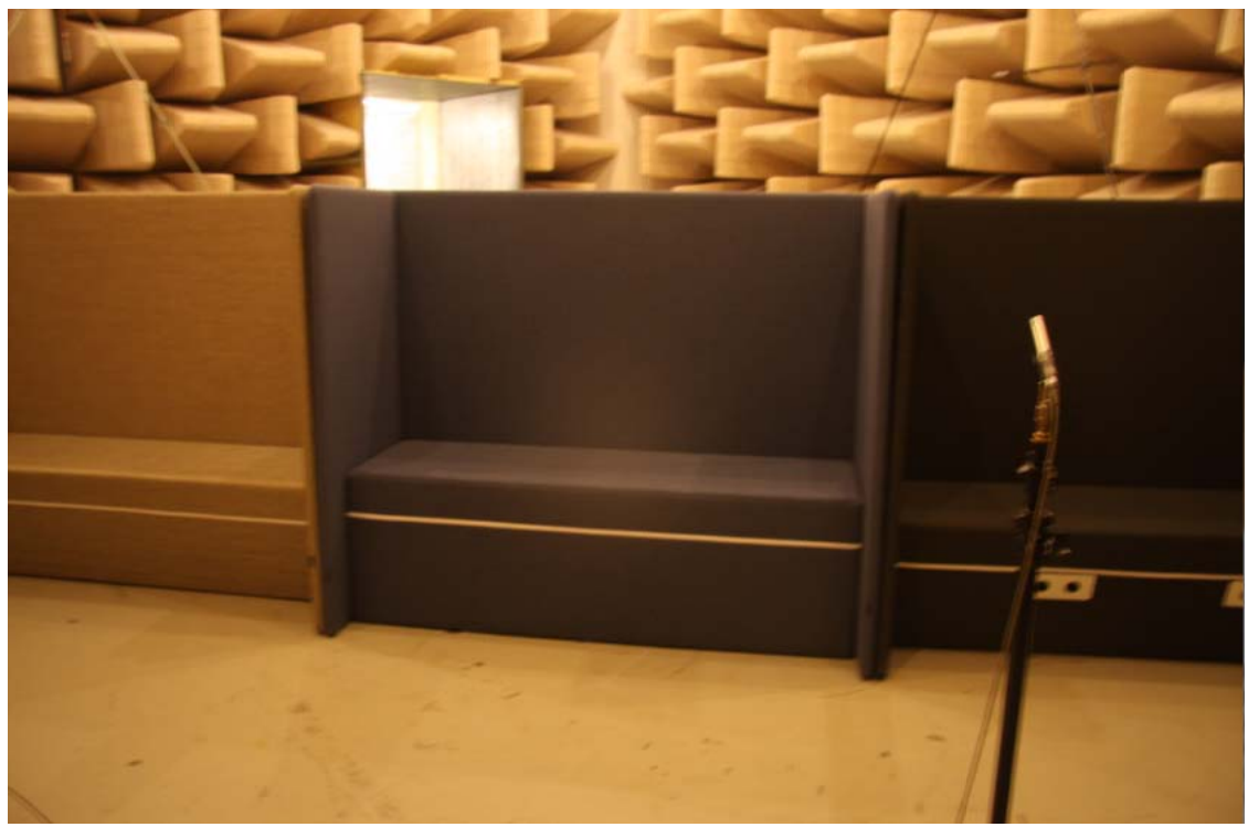
Picture 6 – Test arrangement for measurement of Sofa Sound Booth. The standard microphone position is shown in the picture.